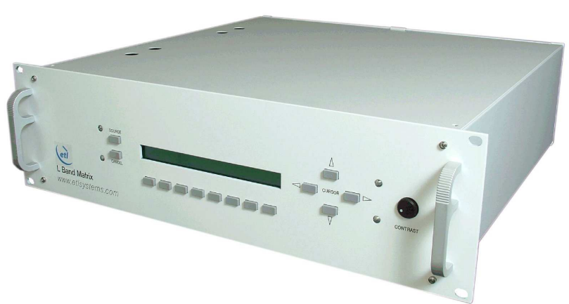
Front View of Model M1616C3UFL-B5B5-A

With Local & Remote Control (via RJ45 Ethernet Port & RS232/422/485 Serial Port)