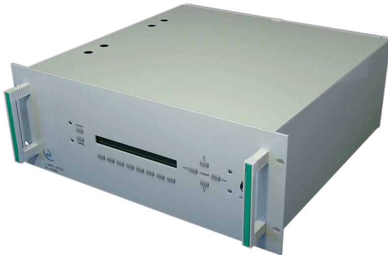
Front View of Model M0824D4UFL-B5B5-A

With local and remote control (via RJ45 Ethernet Port & RS232/422/485 Serial Port) Designed for ships