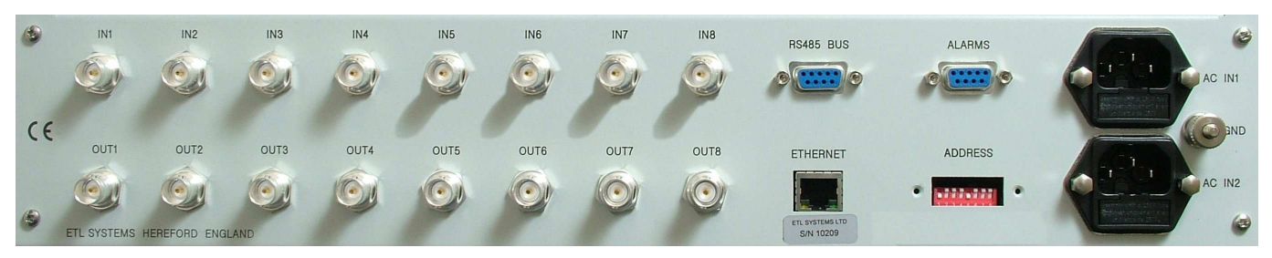
Rear view of similar model

The matrix incorporates a standard ETL controller which can be remotely controlled via either a PC (using ETL software) or integrated into an M & C system. Dual redundant integrated power supply modules provide security against the impact of unforeseen failure. In the event of total power failure, all matrix settings are retained.