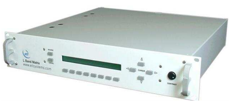
Front View of Model M0808D2UFL-B5B5-A

With Local & Remote Control (via RJ45 Ethernet Port and RS232/422/485 Serial Port)